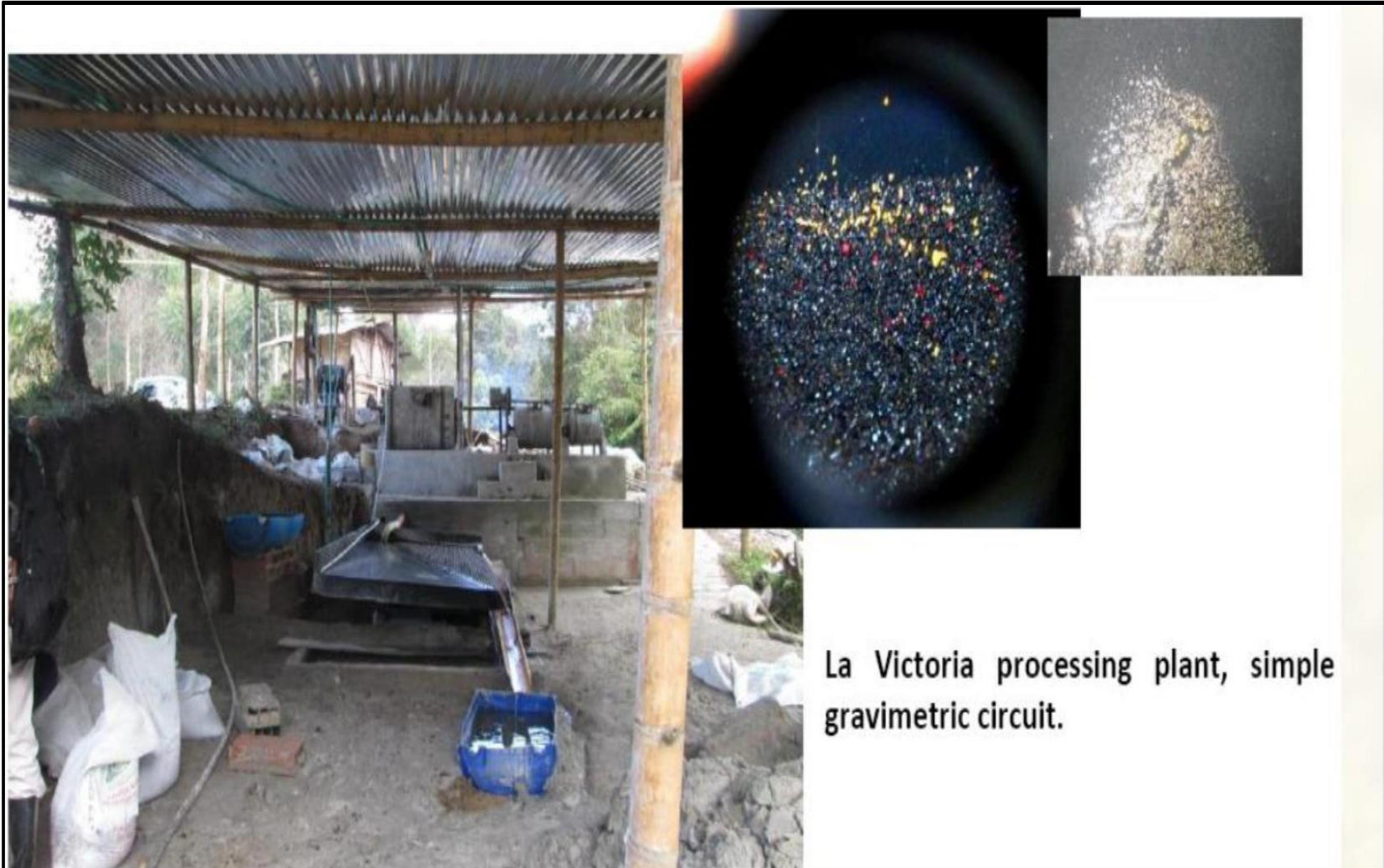
La Victoria processing plant, simple gravimetric circuit.