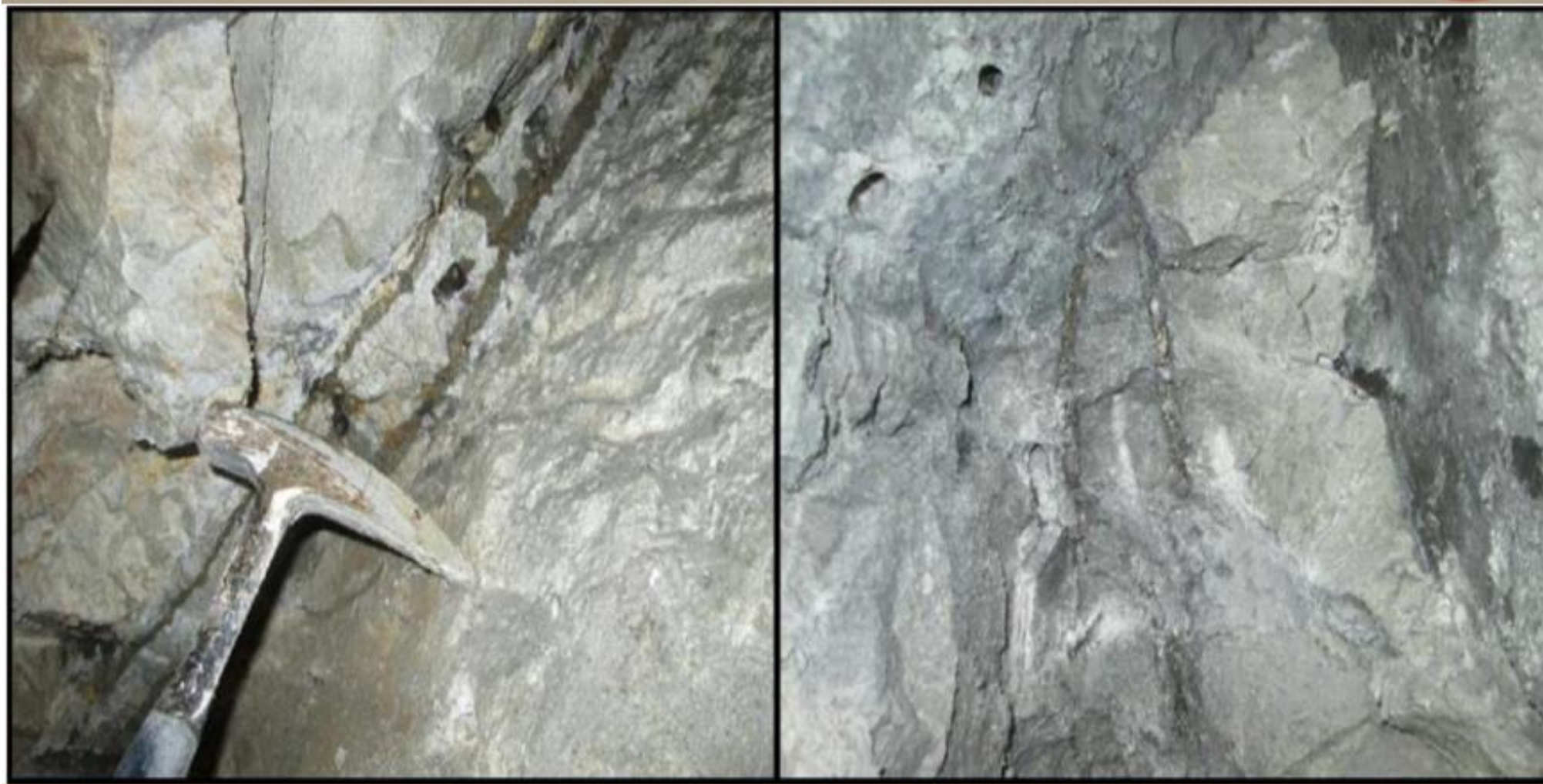
Mineralized structures in mines 1 and 2